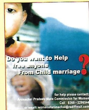
The maiden poster published by APSCW as an advocacy tool against child marriage