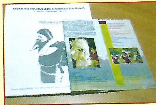
Publications by the APSCW besides a compendium titled Chalo Gaon ki Ore